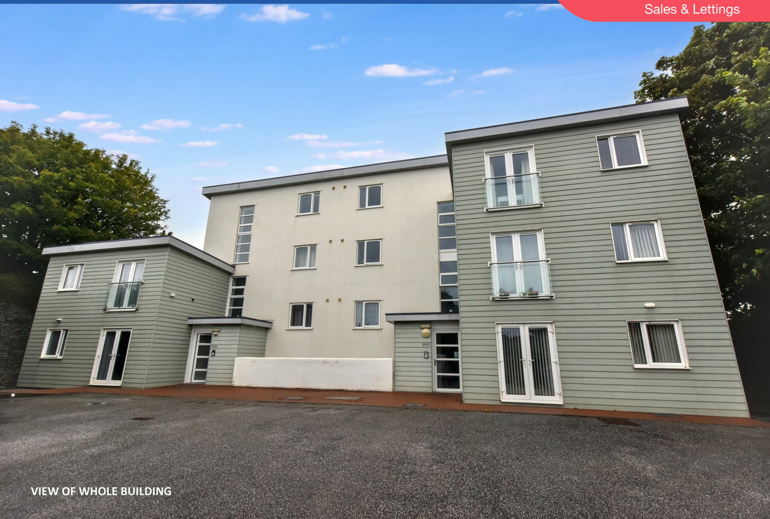
VIEW OF WHOLE BUILDING